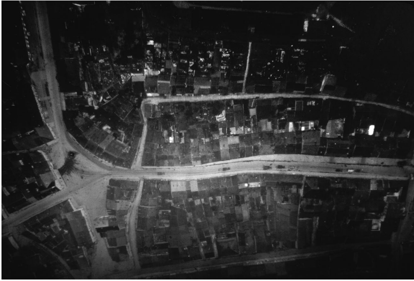
FIGURE 4 Nighttime photograph of road in Europe taken with Edgerton's flash unit in World War II.