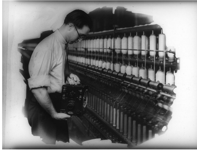
FIGURE 2 Strobotac being used in factory.

Stampfer of Vienna in the middle of the nineteenth century (Killian, 1979: 8). 4 What Killian fails to note, however, is that Plateau's phenakistoscope, Stampfer's stroboscopic disk, and Edgerton's stroboscope each depend not only on the physiological principle of retinal lag, or persistence of vision, but on specific representational codes, for without the repetition of an identically appearing image (e.g. spokes or poles) motion could not appear to 'stand still'. Each of these visual technologies thus depended on interworking physiological principles and visual techniques that together anticipated both physiological and cognitive processes in the viewer. Timing was also a matter of staging. 5