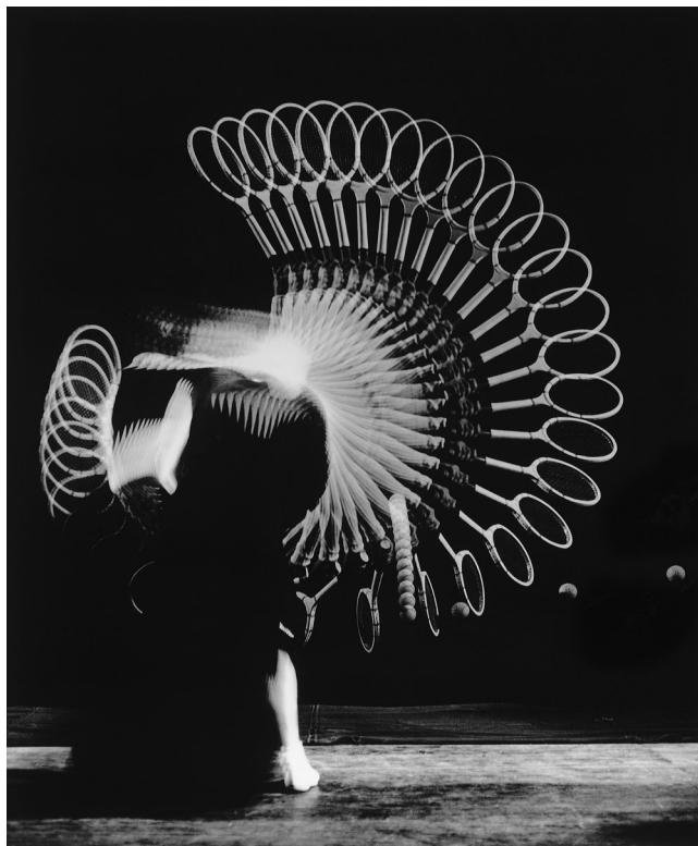
FIGURE 3 A tennis player photographed at 60 flashes/s.

Company the Strobotac, a portable strobe device with an adjustable pulse rate that allowed 'stop motion' effects to be taken into the factories themselves. Suddenly, as one account states, 'operators of all sorts of machinery ... saw faults that were obvious only when the machine was working' ( How Fast is Too Fast? , 1994; Zavattaro, 2007: 2).